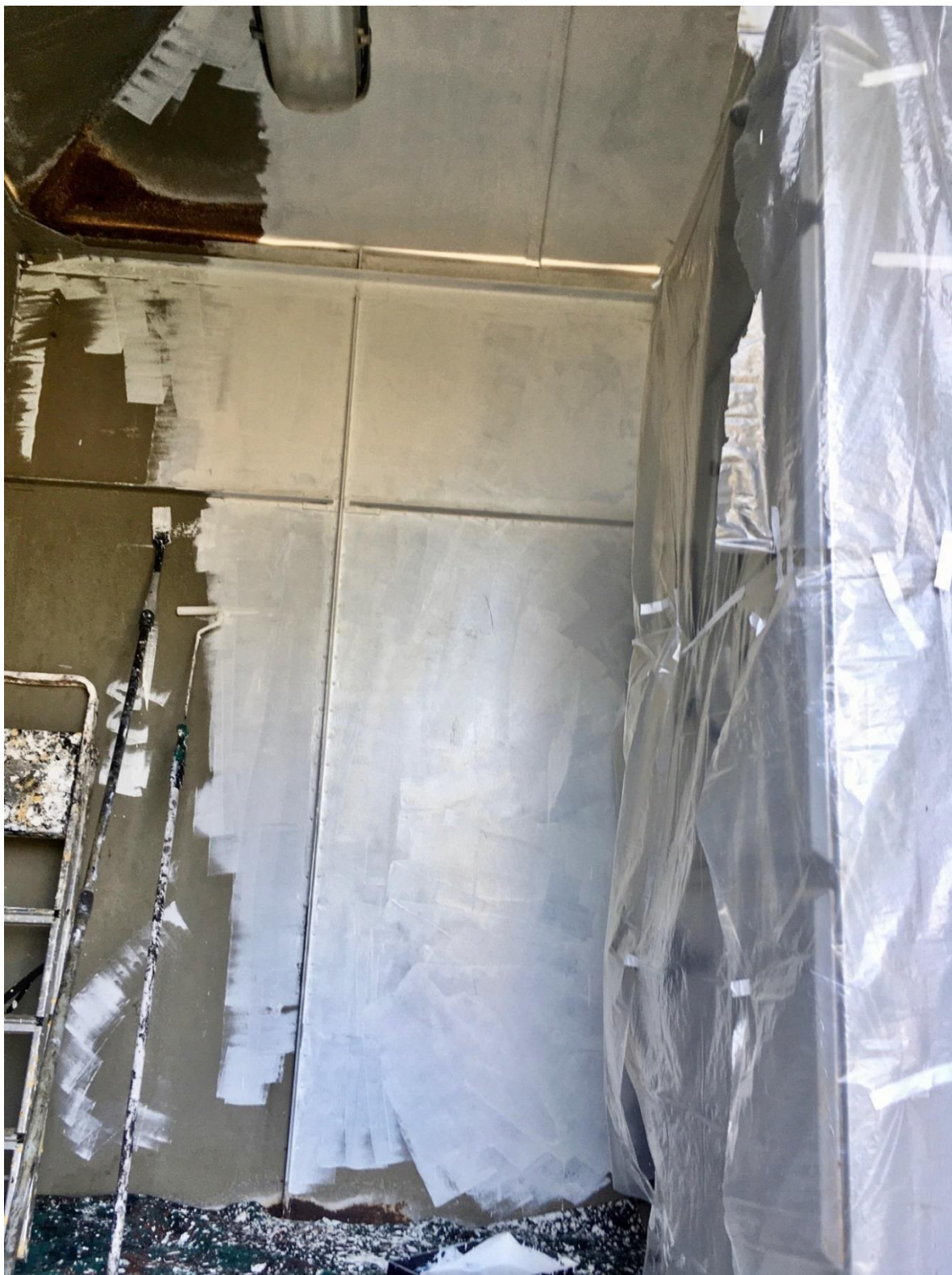
Rust treatment of the inner walls of the transformer-house, financed by the LH Foundation