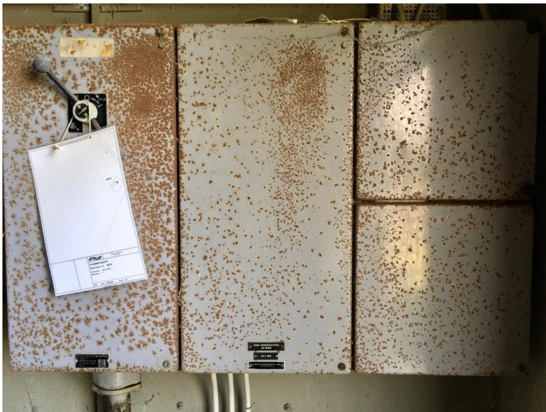
The older metering has been preserved.