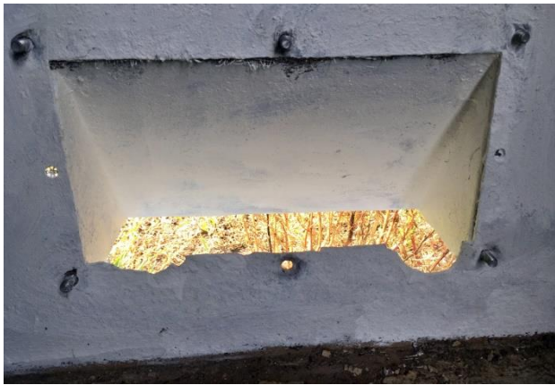
Repair of ventilation and mesh cover (damaged by rust and rats).