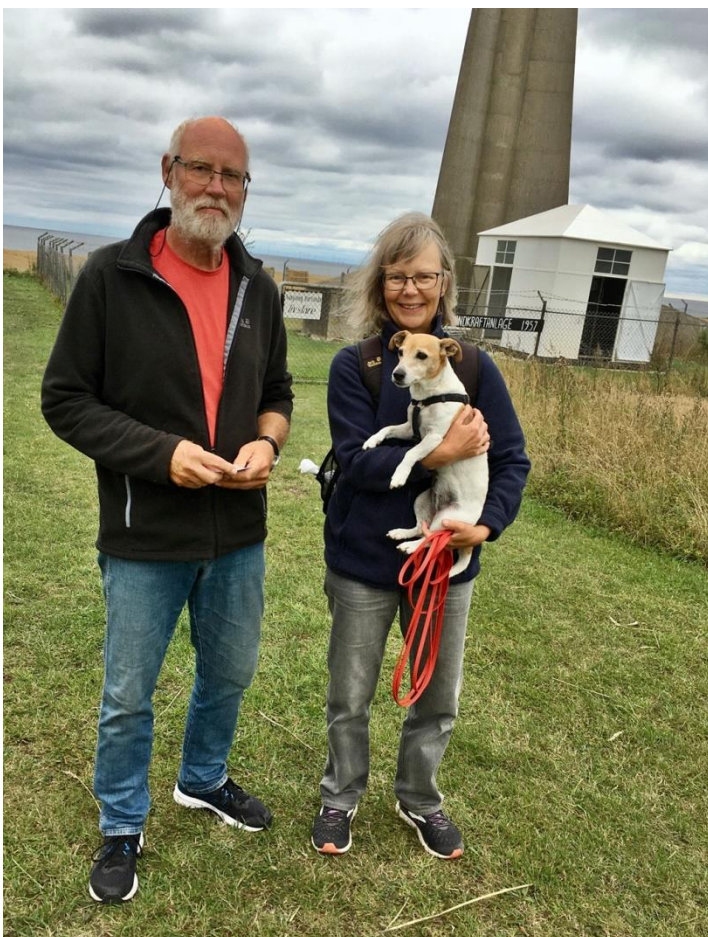
Tourists from rented holiday homes, from Gedser Marina etc. are interested in a presentation of the mill area and the transformer house.