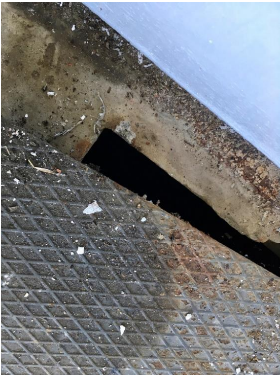
Vinyl is removed from the floor and around the cable trench.